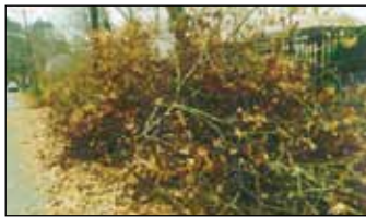
This is not

Trash Collection – Residential/household trash reg scheduled collection is Tues thru Friday please refer to Holiday schedule when a holiday falls during the week. Trash must be placed out in a container or secured in a bag and placed at a convenient place between curb and sidewalk. Recycling will also be collected on your regularly scheduled day. All trash must be placed out after 5:00 pm the night before and before 6:00 am on your scheduled day.