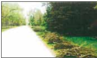
This is the proper way to place branches out for collection

All yard debris accumulated from contracted services must be removed by the company performing the service.